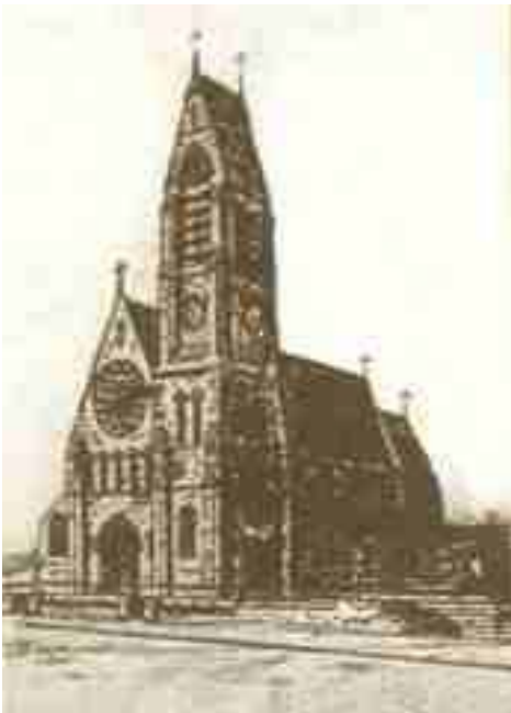
St. Joseph's Church, Mountmellick